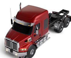
48" Mid Roof