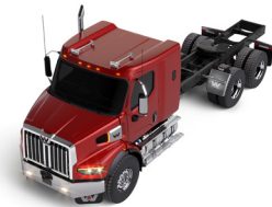
36" Trench-style Low Roof Available in 36" Mid Roof